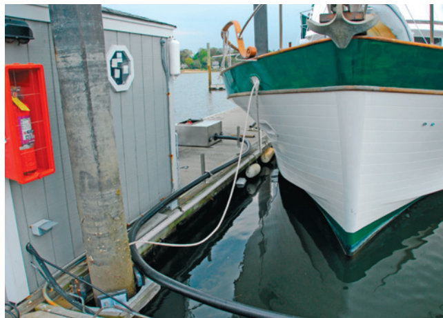
Connection to the dispenser sump

who in turn worked with a petroleum equipment supply company to develop the required fueling system upgrade. This firm contacted BRUGG, because of BRUGG's reputation with marine applications. This installation required running two 2" lines, one for gasoline and one for Diesel. These lines would run from a sump on the shore, across the gangway and over about 459 feet inside a floating dock to the fueling pumps. In this case, the difference between high and low tide was approx. 10 feet, which can be even greater during storm conditions. As a result, the piping would have to compensate a length change across the gangway of almost two feet.